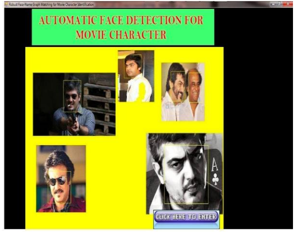
Fig.2: OVERALL RESULT OF FACE DETECTION

Later on, we will stretch out our work to examine the ideal capacities for various film kinds. One more objective of future work is to take advantage of more person connections, e.g., the successive measurements for the speakers, to assemble partiality charts and work on the vigor. In later we will perceive the substance of the film characters which is we use CCTV camera in online as well as our android versatile on the face data set. We recently tracked down that the give its genuine name. This will be done here. Here we are utilizing the with the assistance of these Eigen Object Recognizer we will perceive the face.